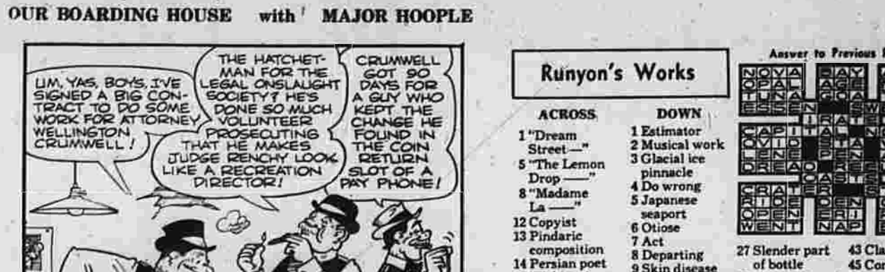
OUR BOARDING HOUSE with MAJOR HOOPLE