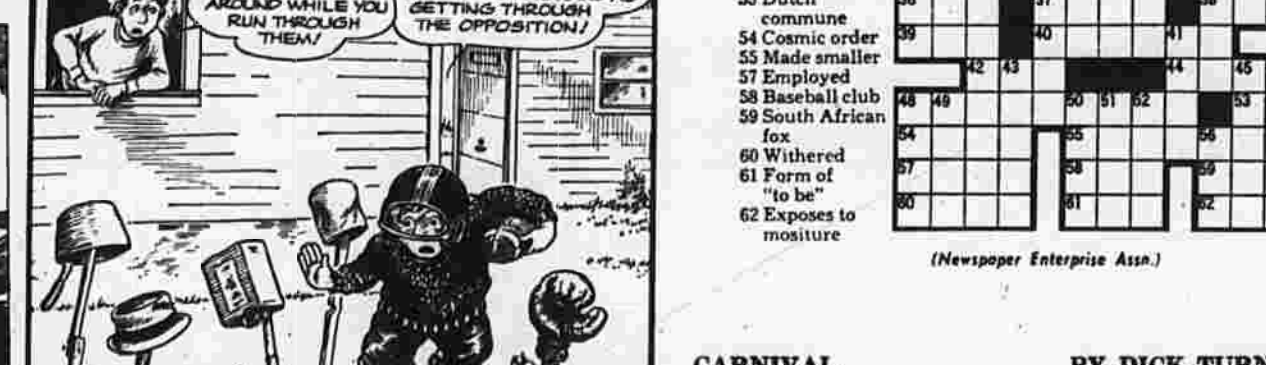
OUT OUR WAY BY J. B. WILLIAMS