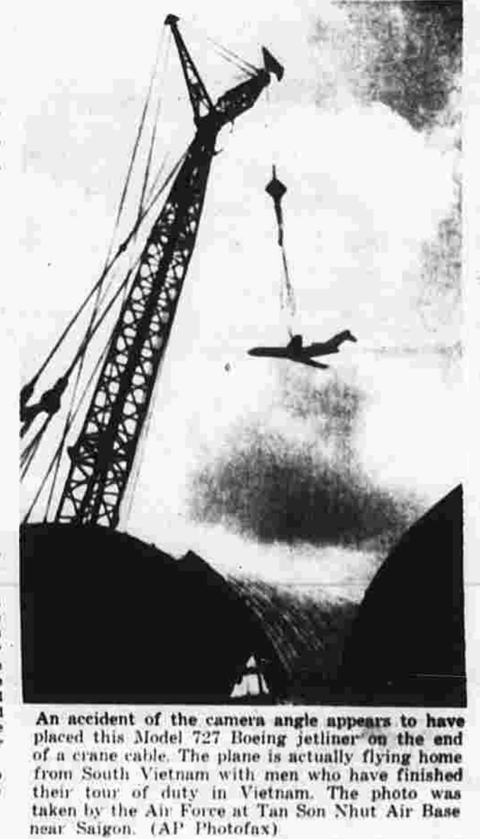
An accident of the camera angle appears to have placed this Boeing jetliner on the end of a crane cable. The plane is actually flying home from South Vietnam with men who have finished their tour of duty in Vietnam. The photo was taken by the Air Force at Tan Son Nhut Air Base near Saigon.