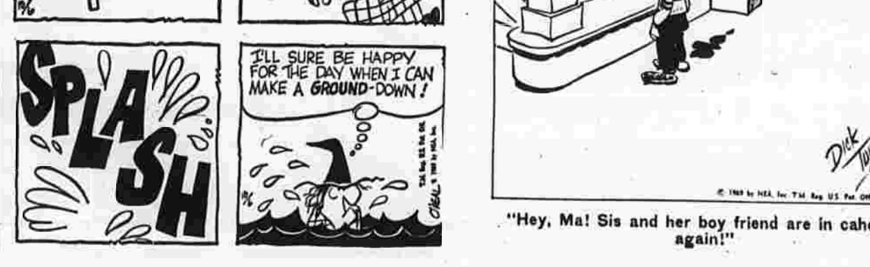
SHORT RIBS BY FRANK O'NEAL