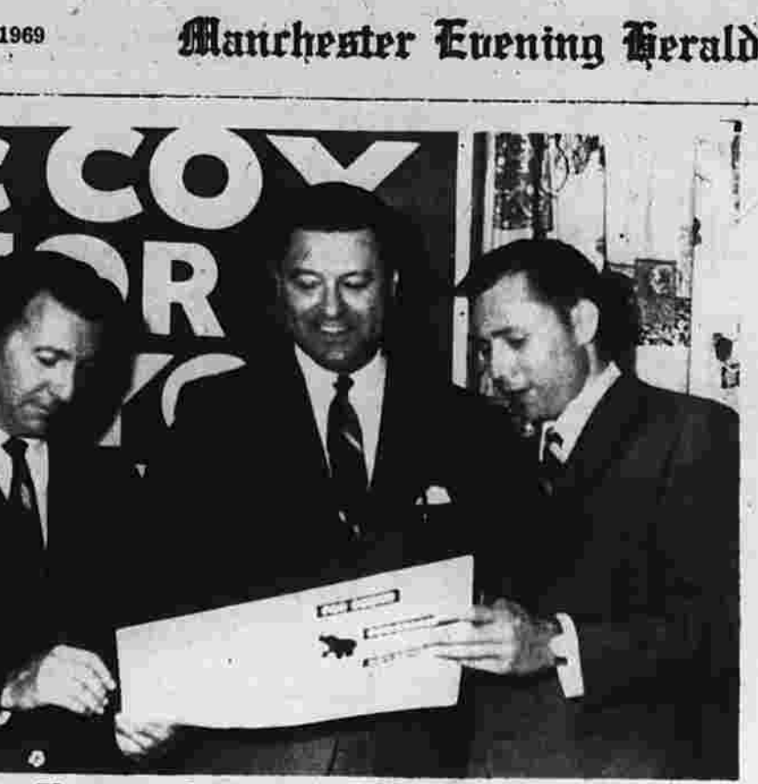
Vermon GOP Opens Headquarters