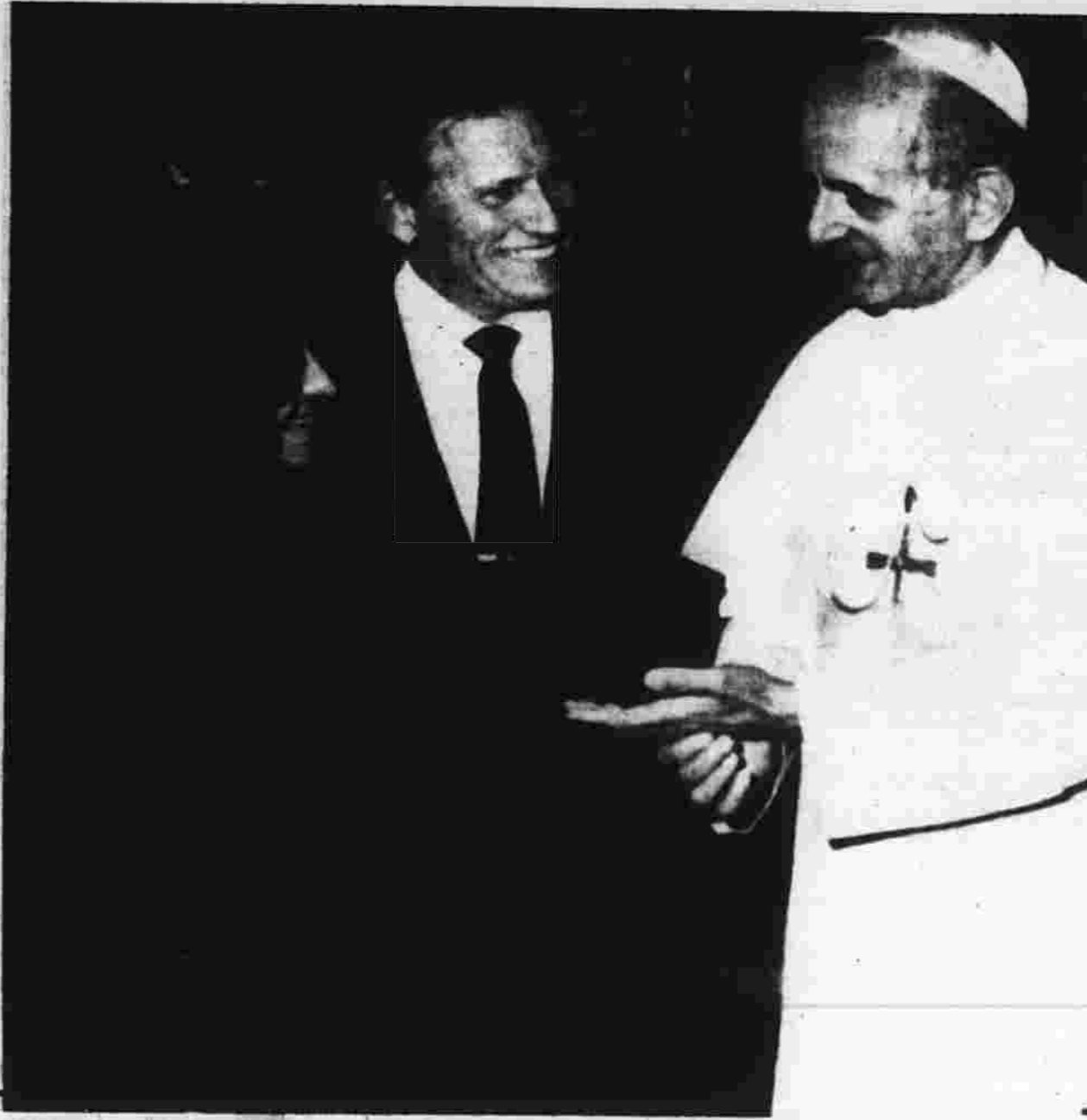
Pope Paul VI, in one of his most recent photos, chats with Transportation Secretary John Volpe and his wife at the Vatican Saturday.

VATICAN CITY (AP) — Pope Paul VI rejected today the concept of some Roman Catholic bishops and theologians that he, as Pope, does not have the exclusive right to rule the whole Church. The 72-year-old pontiff, whose authority has been under fire since he issued his encyclical continuing the Church ban on artificial birth control last year, portrayed as enemies of "the one true Church" all who attack his power to rule. He made the statement to 30 theologians convened in Rome as an advisory commission. The theologians heard the Pope's words at a Mass in the Vatican's Matilde Chapel, then left by car for a secluded area to begin discussing the burning issues in the Church.