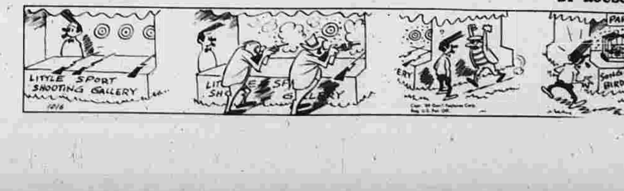
LITTLE SPORTS BY ROUSON